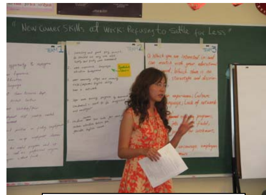
Participant of the focus group from Chinese community

Participants were asked to elaborate on the topic of "Fair and Meaningful Employment" and to specifically explore what they felt were the opportunities for finding it.