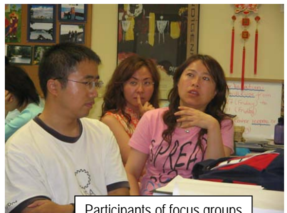
Participants of focus groups

"This has to be a political process, you need to speak to MPPs & MPs to bring issues forward" MNLCT Staff