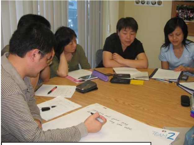
LINC students participate in focus groups

"Someone who survives, maintains hope, builds community connections, finds good work or ways to contribute their skills and gifts, exercises their voice and follows their dreams"