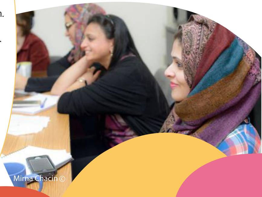
Mirna Chacin ©